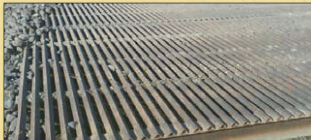
Opens tread on tires so debris can fall into open space

CS offers a variety of products for erosion prevention, soil stabilization and Trackout.