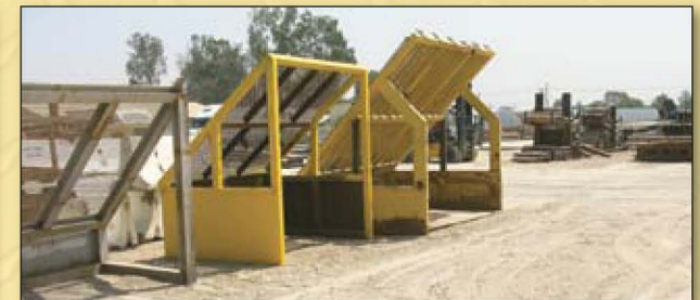
*Custom Sizes Available